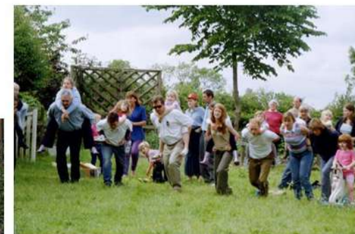
↓ Fancy Dress, Games & a Picnic at The Old Rectory for the Golden Jubilee in 2002