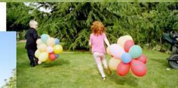
← Diamond Jubilee Bell & Best of British Scarecrows 2012.

www.hicklingnottslcalhistory.co.uk/royalty/