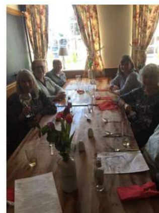
↑ Luncheon Club enjoy a meal at the Arms in Bunny.