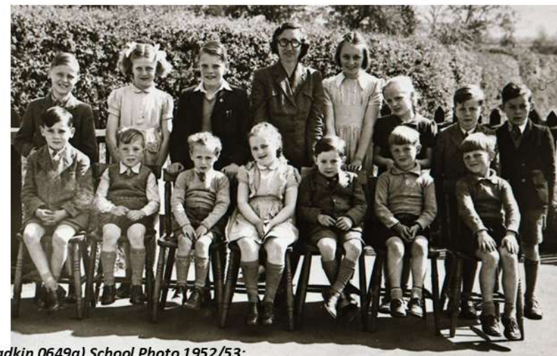
(Wadkin 0649a) School Photo 1952/53: