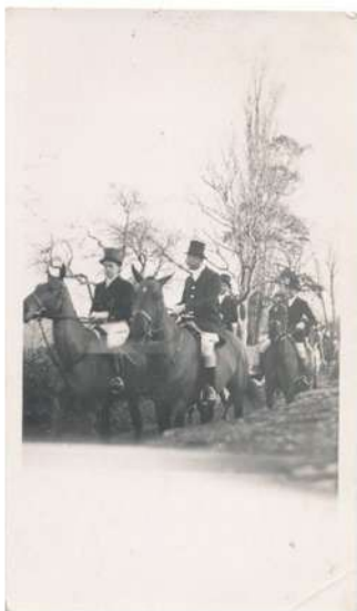
↑ Labelled 'Duke of Windsor and Duke of Gloucester in the late 1920s/early 1930s'—this is likely to show the Prince of Wales before he became Edward VIII (photograph taken in Kinoulton).