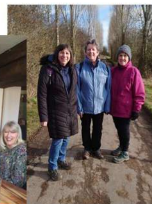
↑ Sunny day for the canal walk ← Lunch at the Randcliffe Arms, Bunny