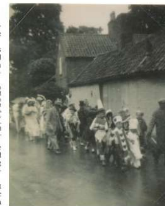
↑ A rainy Coronation Parade in 1953

On Sunday evening at the Methodist church a coronation service was held, and there was Holy Communion at the parish church on coronation morning.