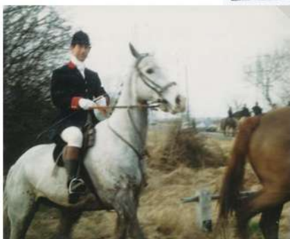
↑ Prince Charles in Hickling (Feb 1981) on the day following his engagement. → One of several pages from the Wadkin collection detailing the village Silver Jubilee Celebrations in 1977.