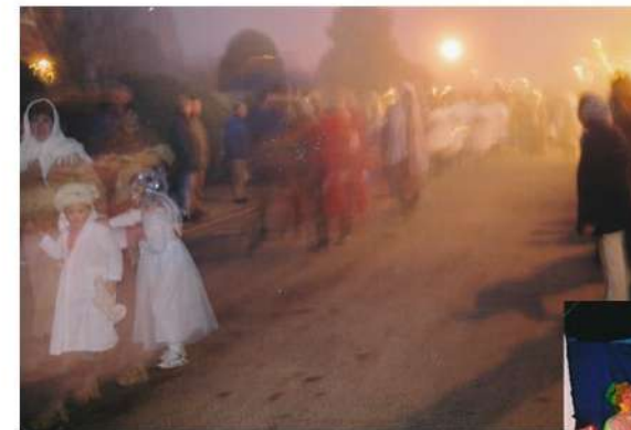
Nativity Pageant paraded through the village finishing in the stable at Malt House Farm (2001)