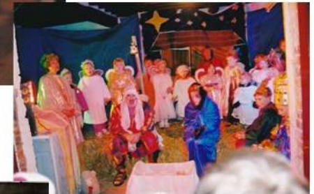
← 1930s Nativity tableau