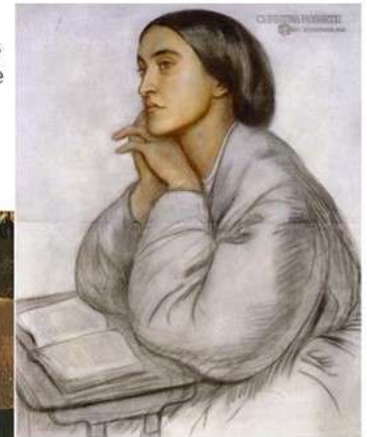
Christina Rossetti: A Christmas Carol.

In the Bleak Midwinter Frosty Wind made moan, Earth stood hard as iron Water like a stone; Snow had fallen, snow on snow Snow on snow, In the bleak midwinter Long ago.