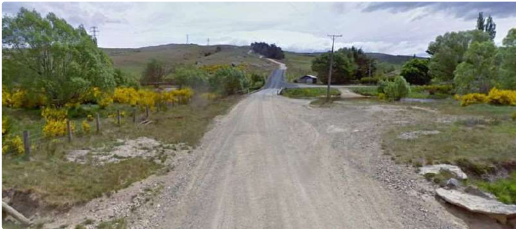
Old Dunstan Road