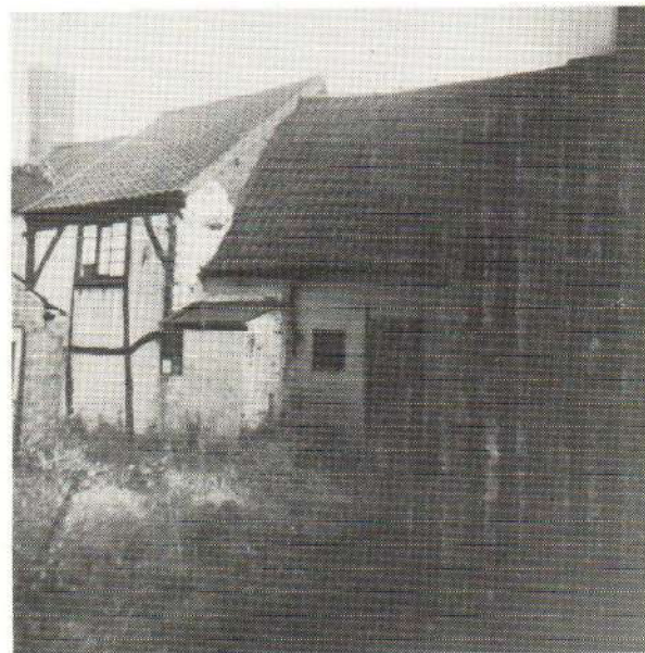
Cruck Cottage - Hodson's Yard 1965

March 1912 For sale by private contract, a pair of freehold cottages containing living room, kitchen, pantry and two bedrooms with out-offices and garden. Apply Mr. Charles Hodson, Hickling.