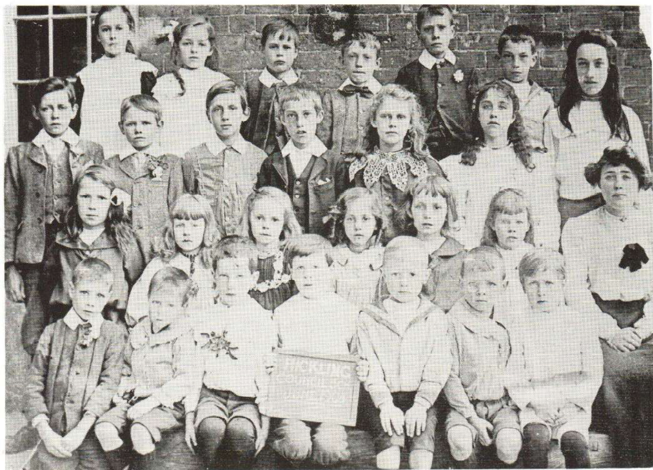
Hickling Council School 1904