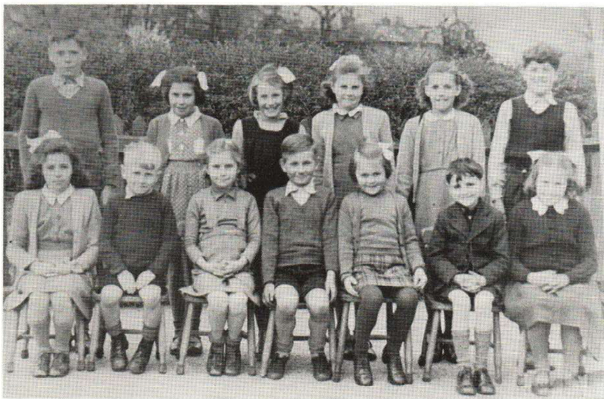
Hickling School 1945