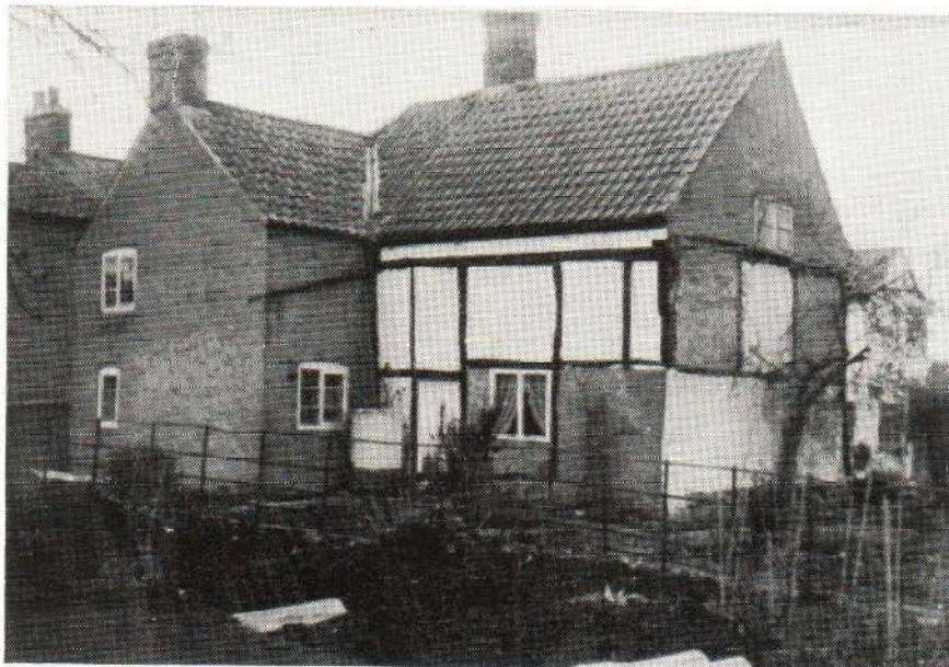
'The Bowling Green'