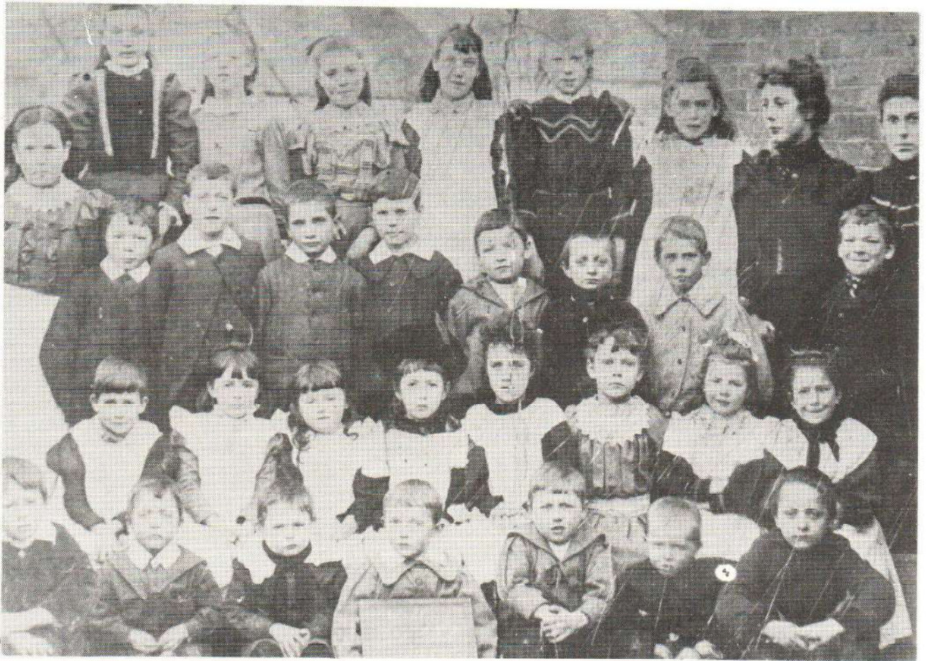
Hickling Board School 1900