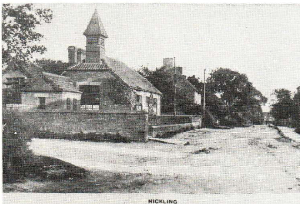
"In the 1920's"