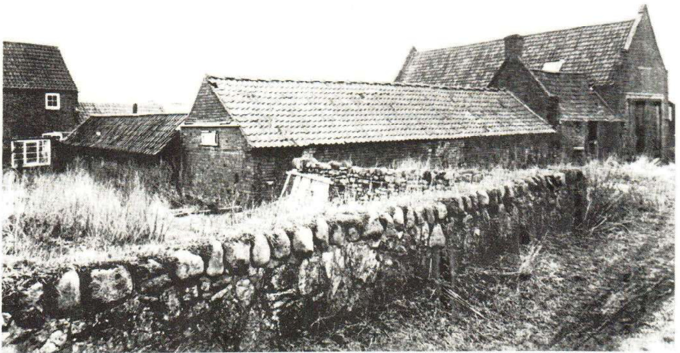
Cowsheds and Barn belonging to Chestnut Farm.

Chestnut Farmhouse, all outbuildings and approximately 1\frac{1}{2} acres land (home field) sold to Spinrock Building Co. in June 1972 for £14,250.