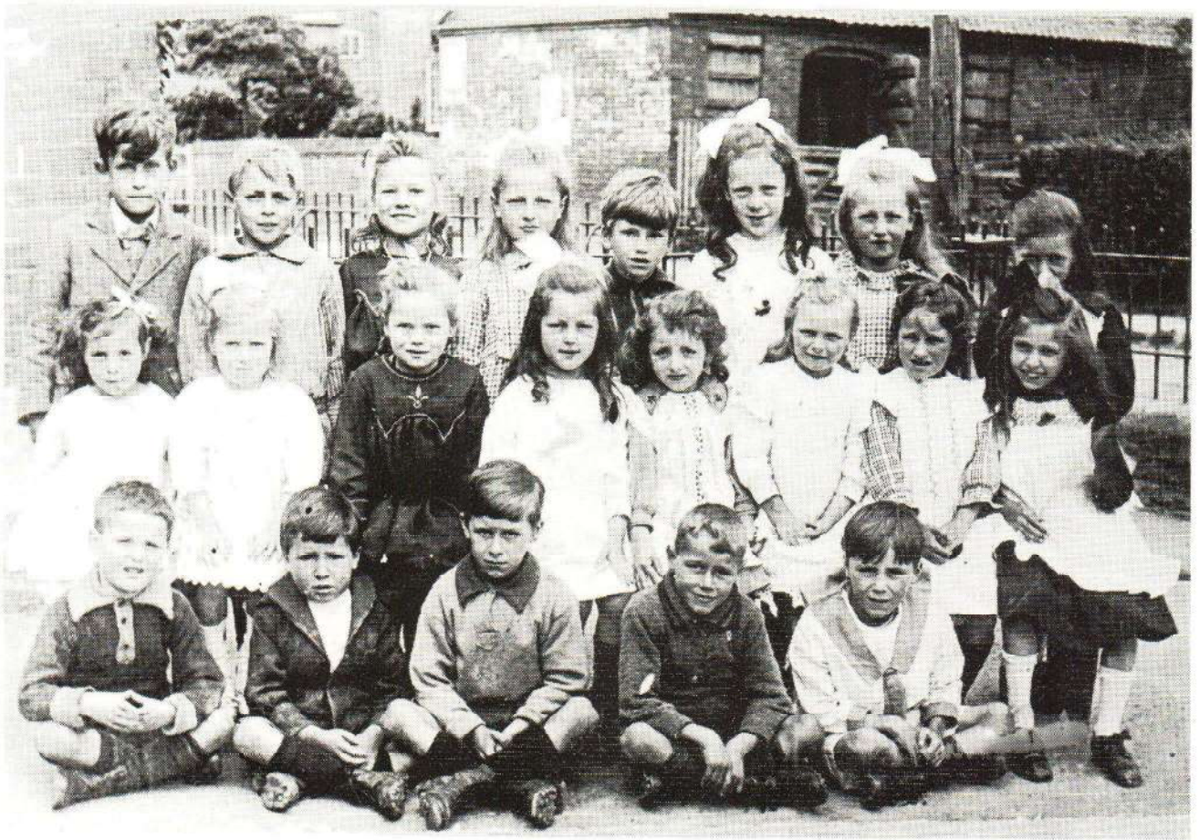
Hickling School Pupils 1922