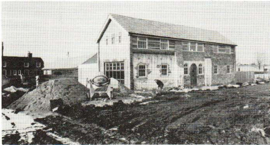
'The Barn' belonging to Chestnut Farm.

Chestnut Farmhouse, all outbuildings and approximately 1\frac{1}{2} acres land (home field) sold to Spinrock Building Co. in June 1972 for £14,250.