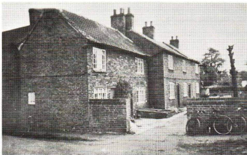
Lot 6 - Cottages situated down 'The Green'