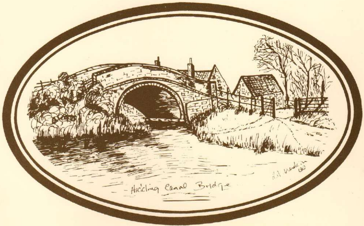
Hickling Canal Bridge